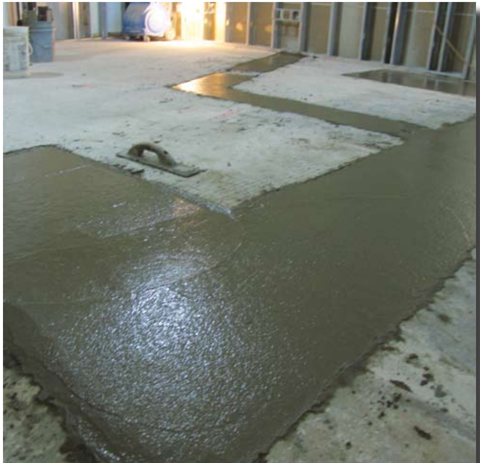
Renovation work continues in the area of JMHC where the new CT scanner will be located. This portion of the renovation project is expected to be completed by early May.