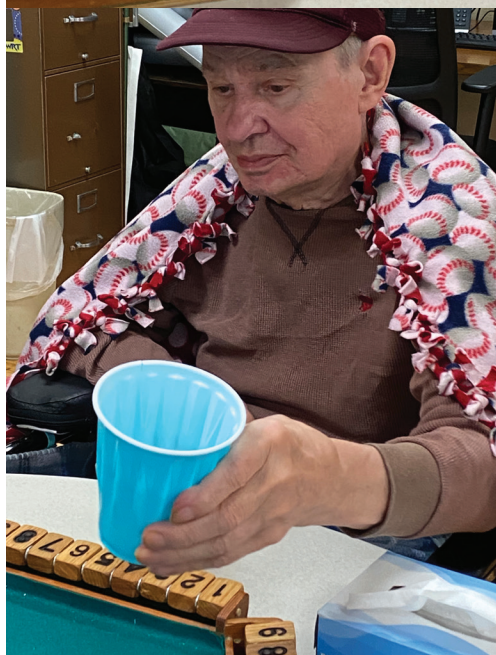
PHOTOS: Residents play a game of Farkle as one of the regular activities they enjoy at Jacobson Memorial Hospital Care Center.